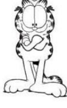
A Little Happy