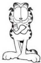
A Little Happy