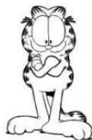
A Little Happy