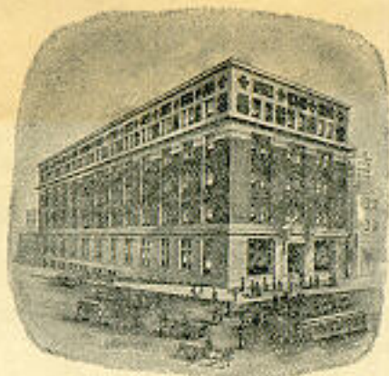
BROADWAY AND NINTH AVENUE