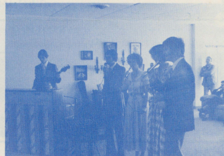
2. Potter's Clay sing