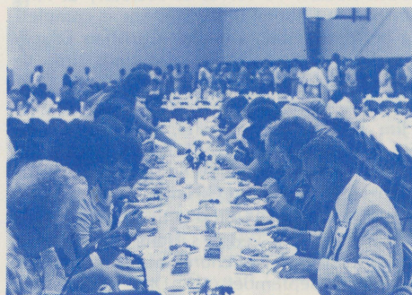
3. Banquet time