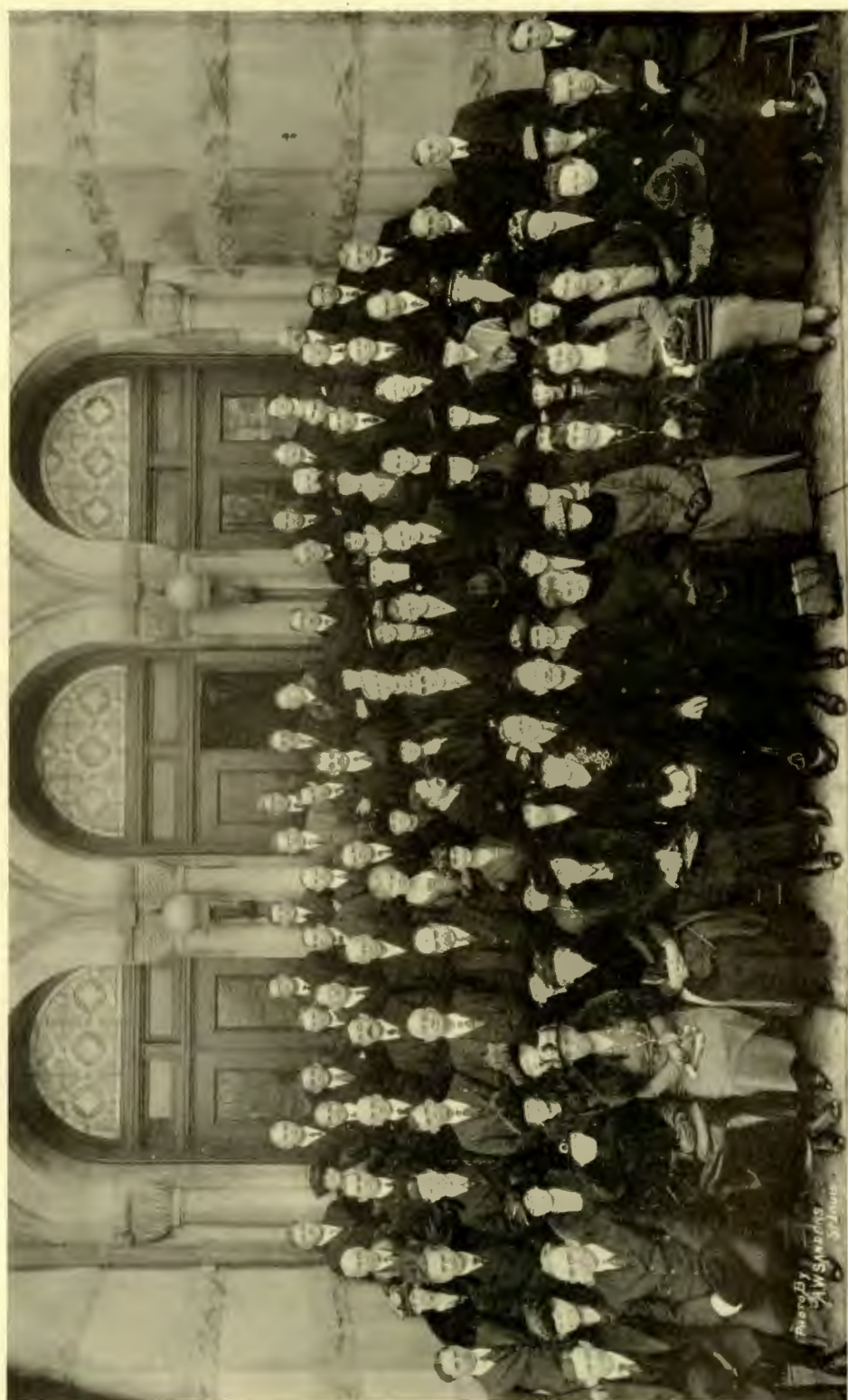
THE S. M. S. CHORUS 1900