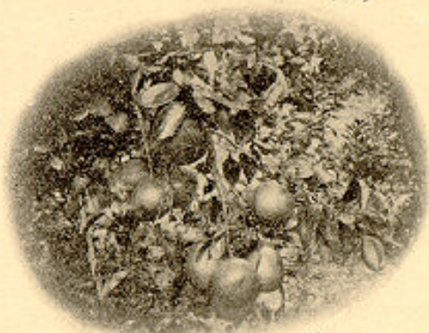
GRAPE FRUIT, McCARTY GROVE, ANDALUSIA