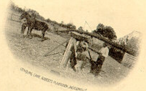
SPRING CANE SWEET PLANTER, JACKSONVILLE