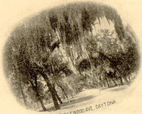
RIDGEWOOD AVE. DAYTONA