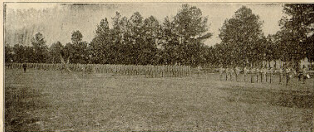
SOME STUDENTS AT DRILL

Also brief courses in Pedagogy, Agriculture, Bookkeeping, Short-hand, Typewriting, Telegraphy, Music and Oratory.