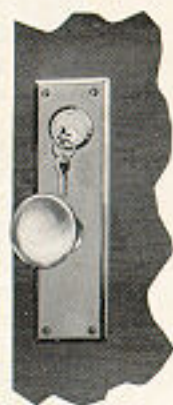
Regular Knob and Escutcheon for No. 722 Aux. Outside of Door

No. 724 Aux. All Brass Metal, Polished, Sectional Grip and Thumb Piece No. 722 Aux. All Brass Metal, Polished, 2 1/2 x 8 in. Escutcheon, 2 1/4 in. Knob. 3 Cylinder Keys, 5 Pin Tumbler Lock