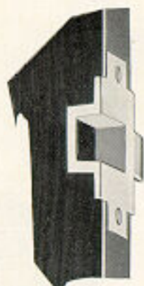
Open Strike for Nos. 724 Aux. and 722 Aux.

Furnished regularly with sectional grip and thumb piece or knob and escutcheon on outside of door; latch operated from outside in same manner as any ordinary thumb latch or lock device. Featured to unlatch latch bolt from inside by touch against bar at any point , even though dead-locked from outside, at the same time permitting door to be opened outward. Latch bolts can be dogged by key.