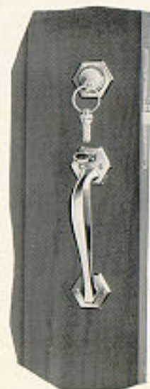
Regular Grip and Trim for No. 724 Aux. Outside of Door